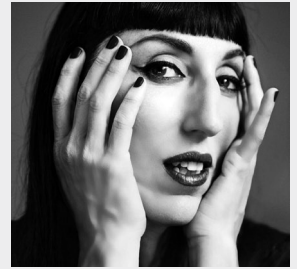
ROSSY DE PALMA