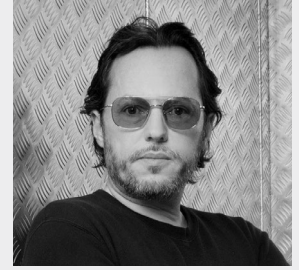
ALEXANDRE DE BETAK