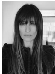
CAROLINE DE MAIGRET