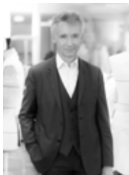
GEOFFROY DE LA BOURDONNAYE