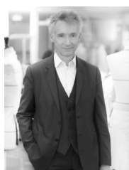
GEOFFROY DE LA BOURDONNAYE