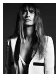
CAROLINE DE MAIGRET